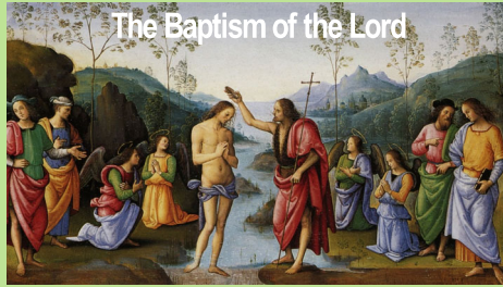
The Baptism of the Lord

* Takes place at Sts. Cyril & Methodius in Damon