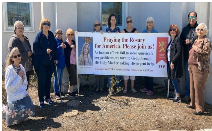
Rosary Crusade - Saturday, October 14, 2023

*Note: Currently our bulletins are being provided at no charge to the church due to the sponsors on the back page; however, you will note we do not have many local sponsors. In the future if sponsorship is not covered by the ads we may be paying for the printing of the bulletins each week.