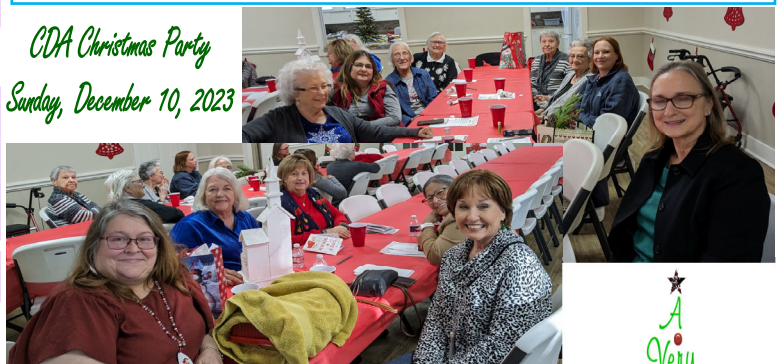
Merry Christmas from CDA Court #2340