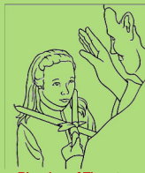
Blessing of Throats at all masses this weekend