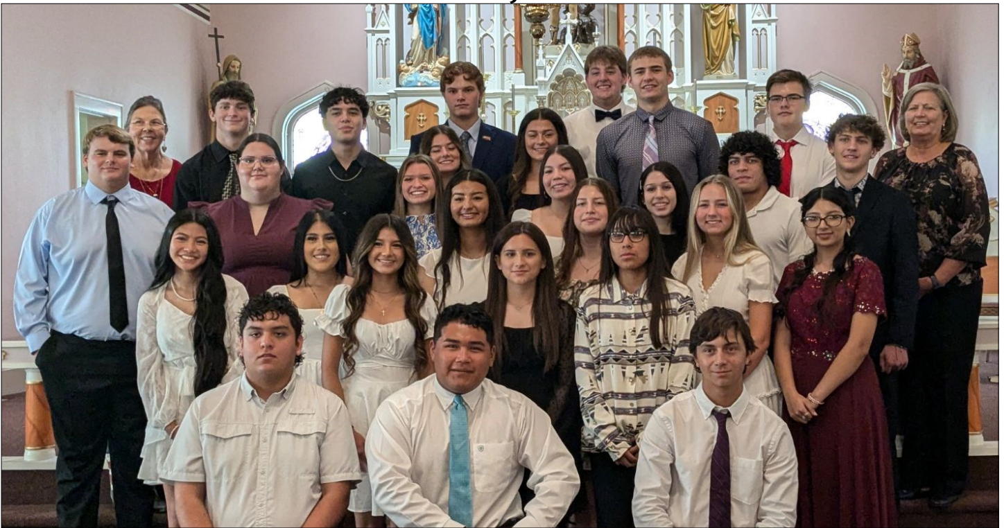
(Not pictured in order listed.)