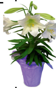
Cost $12 each

St. Michael's: https://giving.parishsoft.com/app;/giving/stmc Sts. Cyril & Methodius: https://giving.parishsoft.com/app/giving/stscm