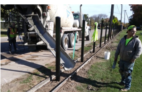
LEFT: Concrete was laid at the end of October.