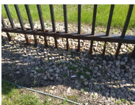
LEFT: The old cemetery fence was rusting beyond repair.

black iron fence that spanned the frontage of the cemetery along Little Canada Road finally reached the point it needed to be heavily repaired or replaced. Knowing the history of this fence—it originally was located outside the streetcar tunnel near the Cathedral at Selby Avenue—the Cemetery Committee sought to repair it, but it was just too damaged and the costs were too high to justify that approach. The committee vetted several proposals from vendors opting to install an ornamental-steel, commercial-grade fence that had a similar look to the original fence design. After socializing these bids and plans with the various parish groups and approval from Father, work began to replace the fence in October. There remains only one more panel to install and then there will be some dirt work to take care of in the spring. Check out the photos of the project (at right).