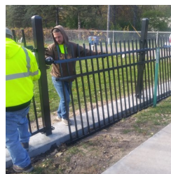
RIGHT and FAR RIGHT: Fence panels went up after Halloween; the project will conclude with dirt-laying in the spring.