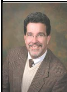
50219 Hwy. 101 South, Suite D-1 Bandon, OR 97411 541-347-1200

3 month ad, $70 3 month double ad, $100 6 month ad, $140 12 month ad, $250