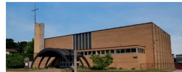
St. Catherine of Siena 1909 Broadway Ave. Pgh, PA 15216