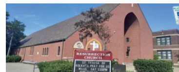
Resurrection 1100 Creedmoor Ave. Pgh, PA 15226

If you have a concern about the parish, please contact our Parish Pastoral Council at: PPCSTK@gmail.com