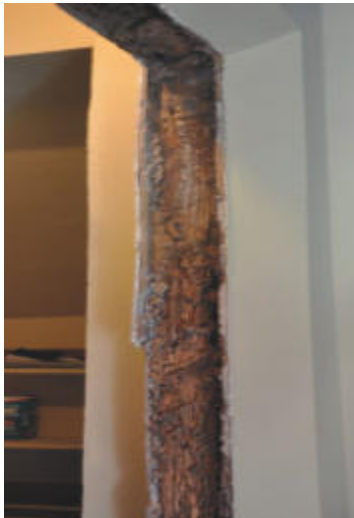
Picture of termite damage

After the 10:30 mass in the nursery/confessional at the back of the church on the Loyola side.