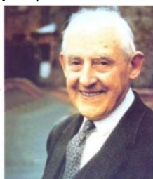
The founder of the Legion of Mary Servant of God, Frank Duff 1889-1980

The Legion family Worldwide On all continents In over 170 countries 4 million Active members 5 million Auxiliary Membership