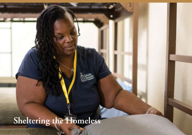
Sheltering the Homeless