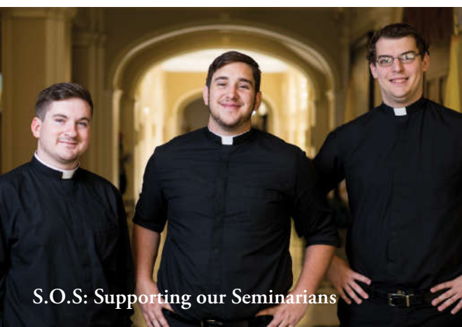
S.O.S: Supporting our Seminarians

"Will you let my love be shown, Will you let my name be known, Will you let my life be grown, In you and you in Me?"