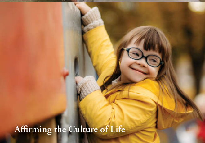
Affirming the Culture of Life