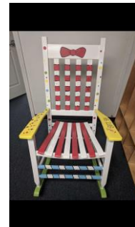
KB Rocking Chair

There will also be lots of teacher/class items in the Silent Auction, as well as lots of “goodies” that you don’t want to miss. Here are a few pictures of some of the teacher/class Silent Auction items: