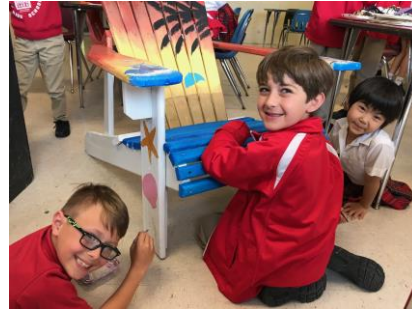
2G – Work in progress.