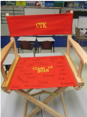
7T – Director's chair, front row seating at the evening performance of the 7 th grade play, and a framed cast photo.

Attached is the Class Performance Schedule for this weekend. Remember that individual class items will be auctioned off immediately after each class performance. Students get so excited when the bidding gets going, so be there to support them. Here are a couple of items: