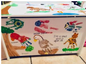
KS Toy Chest