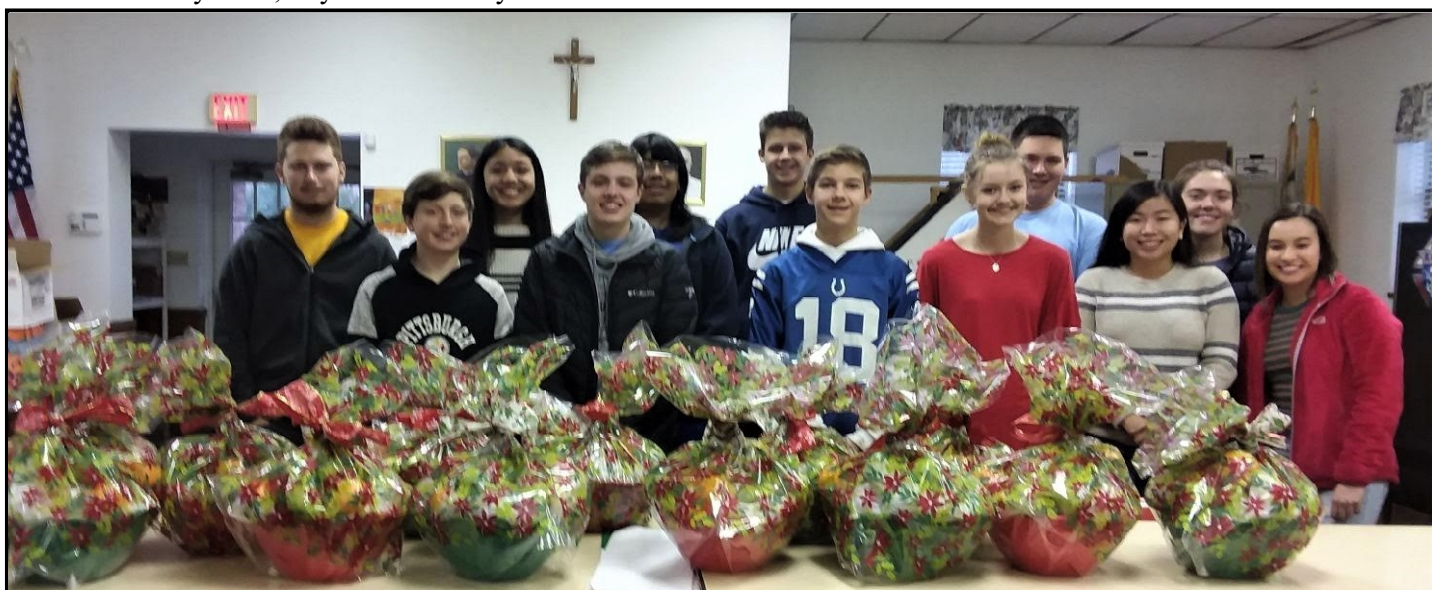
The Youth Ministry at Holy Rosary Church wrapped and delivered fruit baskets for the shut-ins there. They also were able to shop and then wrap presents for a family in need.