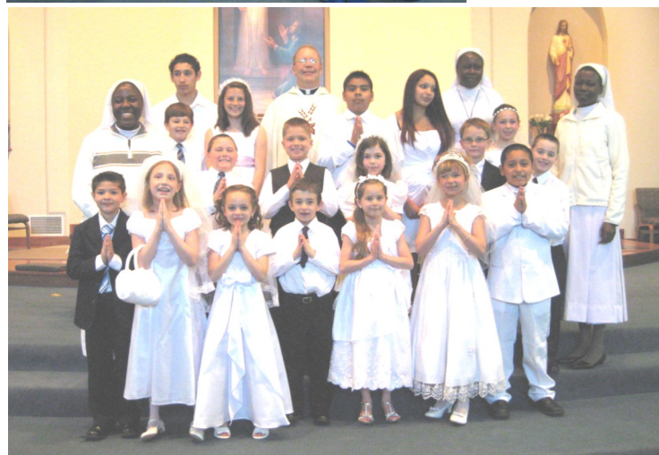
St. Thomas Church First Holy Communion Class of 2011