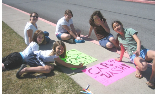
Middle School youth getting ready.