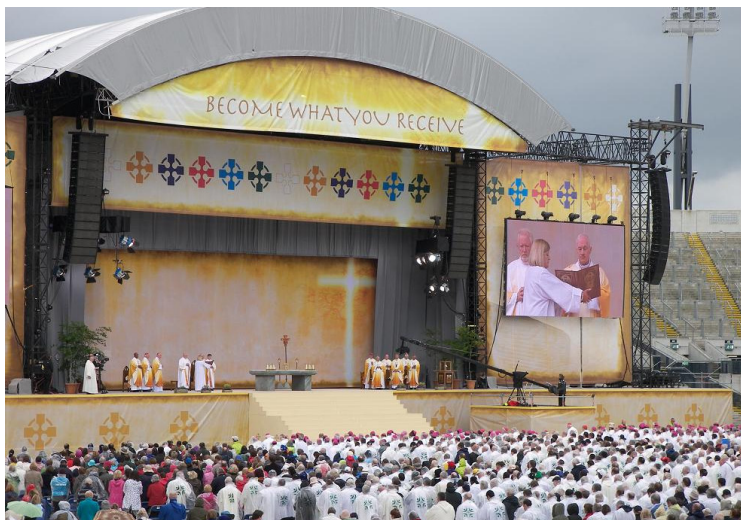
Closing Mass (Statio Orbis) at Croke Park in Dublin.