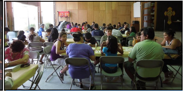
Primera Actividad del Grupo completo y comenzando a conocerse