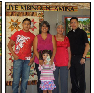
Familia Ketchu Ontario OR