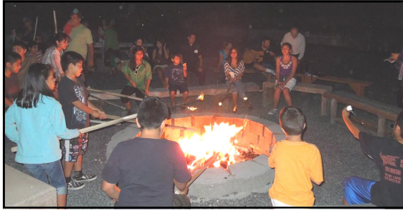
Asando Bombones antes de rezar el Rosario en el anfiteatro