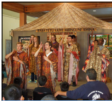
El Consejo Juvenil actuando el Padre Nuestro en Swahili