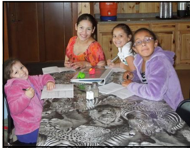
Actividad en Familia