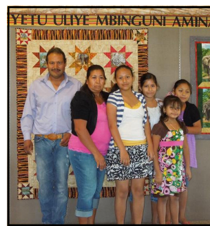
Familia Tinoco Ontario OR