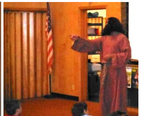
St. Anna Schaffer and St. Paul speaking to the children.