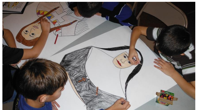
Students shown drawing and coloring “portraits” of the newly canonized saints, St. Anna Schaffer (R) and St. Kateri Tekakwitha (L).

Later in the month, one of the newly canonized saints, St. Anna Schaffer, made a surprise visit and told them her story. Her message to the children was that no matter what your “state” in life, we can serve God. St. Anna Schaffer served God even though she was confined to a bed after a very serious accident in which she fell into a boiling vat of lye. The accident left her unable to walk and she suffered incredible pain throughout her life. She considered her suffering, her writing, and her ability to knit clothes for her friends the three “keys” by which she could enter Heaven. Her beatific attitude made her a beloved figure in town and people would often visit her to hear her comforting words of faith.