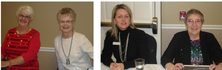
The Ladies at the Front Desk (above)