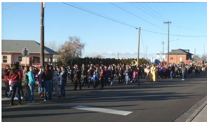
Between 400 and 500 parishioners walked and sang for three miles. They closed with Benediction.