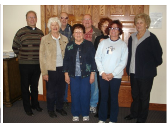
Gala Committee Members