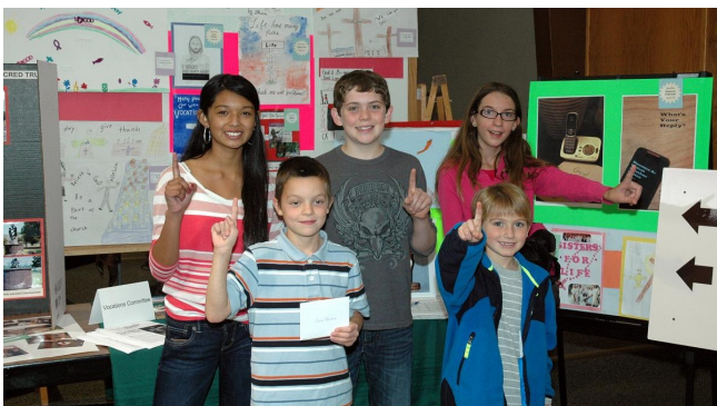
Some of the First Place Winners of the Vocations Poster Contest

The parish Vocations Committee has a number of other activities planned for the rest of this year to help strengthen a "culture of vocation" within our Parish and our Diocese.