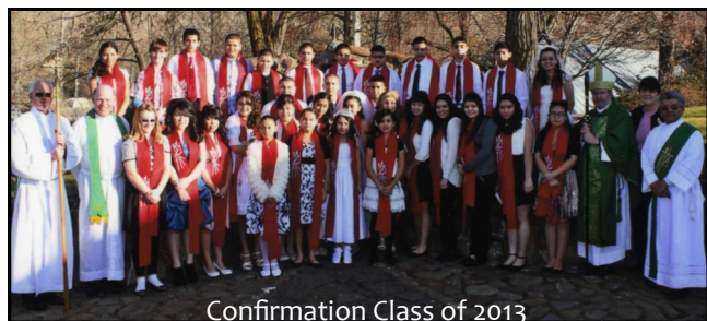
Confirmation Class of 2013