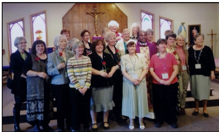
The Catholic Daughters of the 25th Court "Our Lady of the Pines" No. 2675 Holy Redeemer, La Pine March 16, 2014

Dedicated to strengthen their spiritual life through Christ and his Church, Catholic lay and religious women 18 years or older, who love and support the Church, and wish to participate social and charitable activities are welcome.