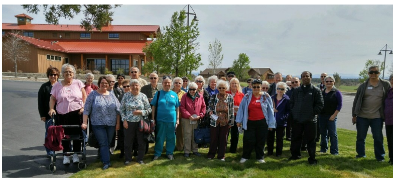
A tour of the Powell Butte grounds was part of the journey and for some, the first opportunity to visit the Powell Butte Retreat Center.