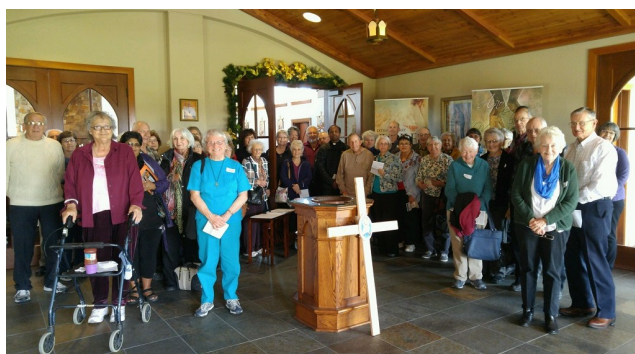
After the group passed through the Holy Door, they united in Adoration, praying the Divine Mercy Chaplet, and singing hymns.