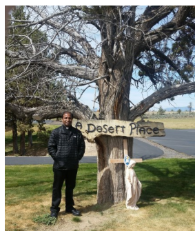
Before departing, they gathered at the statue of the Blessed Mother for their final prayer.