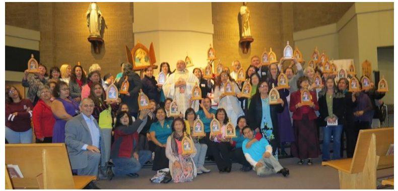
Pictured here are over 60 Rosary Campaign Missionaries with their Pilgrim Mother shrines at one of the Masses at the conference.