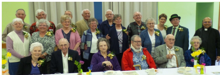
Congratulations on 873 combined years of marriage.