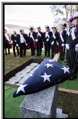
U.S. Flag from Military Honors and Dedication Marker