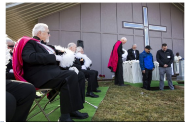
A time for silent prayer