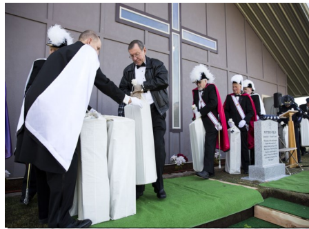
Knights of Columbus moving cremains next to the burial plot.

The local newspaper and a few television news outlets, including EWTN have reported the event. The advertisement has allowed several of the cremains to be reunited with their families. We must give thanks to God for allowing us the opportunity to perform this Corporal Work of Mercy.