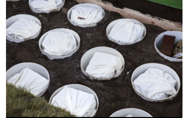
Cremains inside Ossuaries