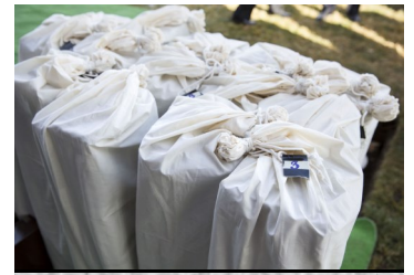
Cremains in shrouds