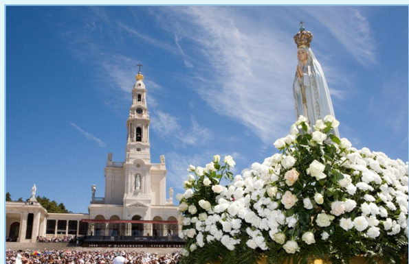
Our Lady of Fatima, Portugal