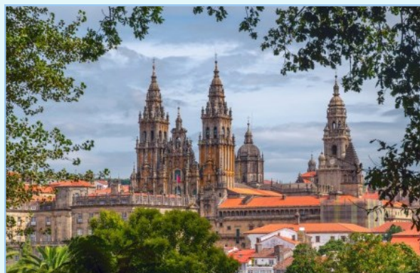
Cathedral of Santiago de Compostela, burial place of St. James the Apostle