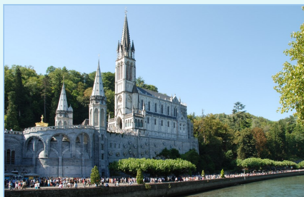
Basilica of the Rosary, Lourdes