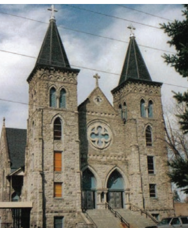
Front doors before (above), and after (right) re-painting.

Please visit us at the Cathedral to see how your donations to the Cathedral Conservation Collection were used to beautify our mother church of the Diocese.