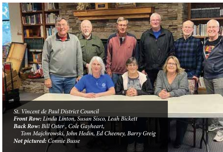
St. Vincent de Paul District Council

United States Conference of Catholic Bishops (USCCB) - Special Assembly in San Diego, CA