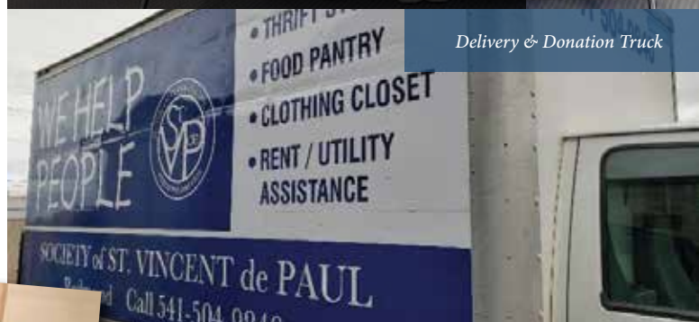
Delivery & Donation Truck