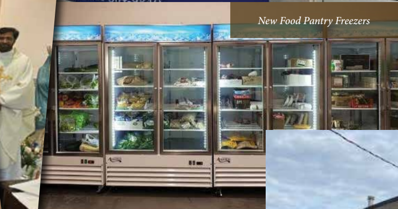
New Food Pantry Freezers