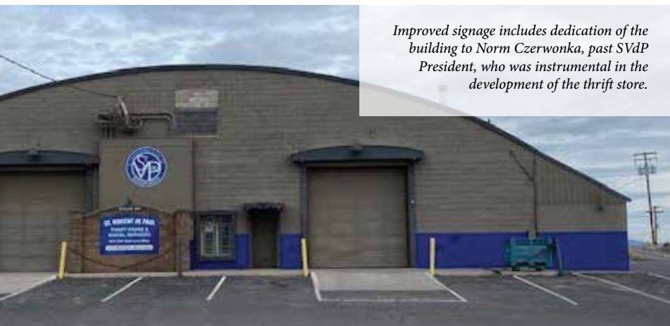
Improved signage includes dedication of the building to Norm Czerwinka, past SVdP President, who was instrumental in the development of the thrift store.