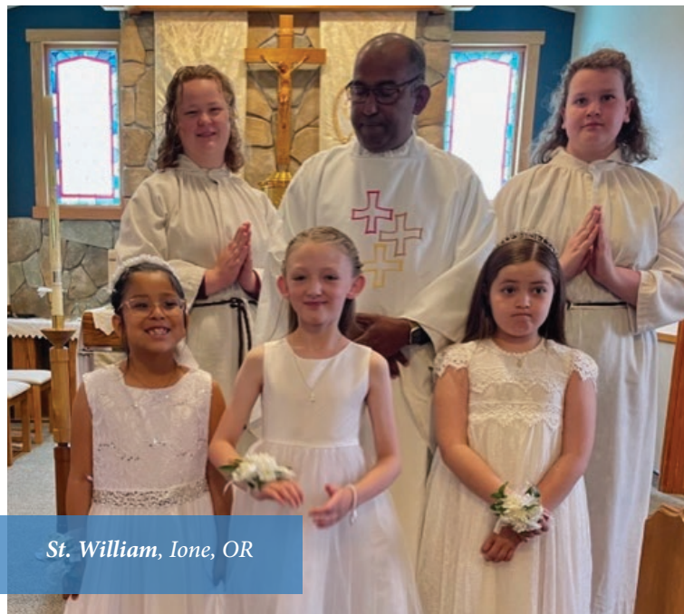
St. William, Ione, OR