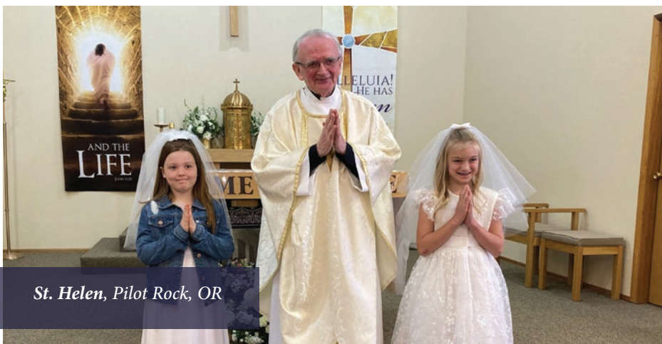
St. Helen, Pilot Rock, OR