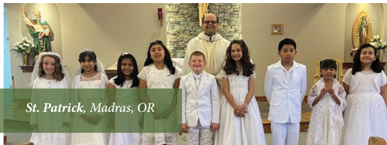
St. Patrick, Madras, OR