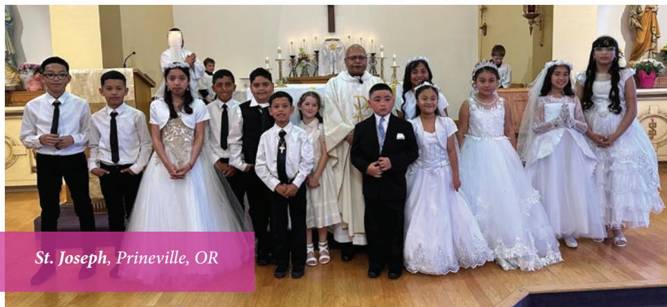
St. Joseph, Prineville, OR