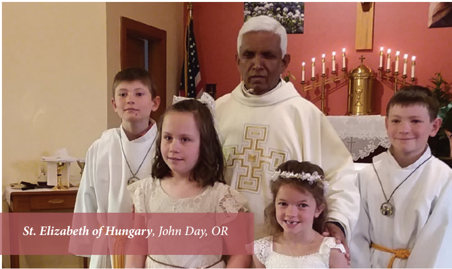
St. Elizabeth of Hungary, John Day, OR

Cuando el Cuerpo y la Sangre de Cristo nos son entregados, decimos “Amén”. Es la abreviatura de “Yo creo que Jesucristo está verdaderamente presente aquí, como dice la Iglesia Católica que lo está”. Abra un poco más nuestro ‘Amén’ y encontrará una confesión aún más completa: “Yo creo en la Iglesia Católica, que hace posible esta íntima Comunión con Jesucristo. Yo acepto la autoridad dada por Cristo al Papa y a los obispos, que nos envían sacerdotes para que perdonen nuestros pecados en la Confesión y nos reúnan para la Comunión en la Misa. Yo creo lo que la Iglesia Católica nos enseña sobre la Virgen María y los santos (a quienes siempre recordamos en la plegaria Eucarística) y sobre la necesidad de rezar por los difuntos (lo que hacemos en cada Misa)”. En resumen, la simple acción pública de recibir la Comunión en Misa “habla” esta confesión: “Yo soy Católico”.