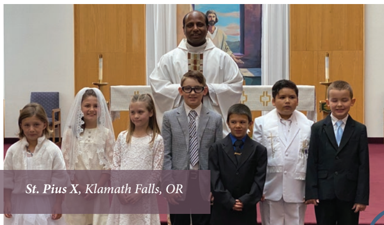
St. Pius X, Klamath Falls, OR