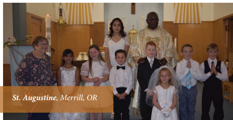
St. Augustine, Merrill, OR