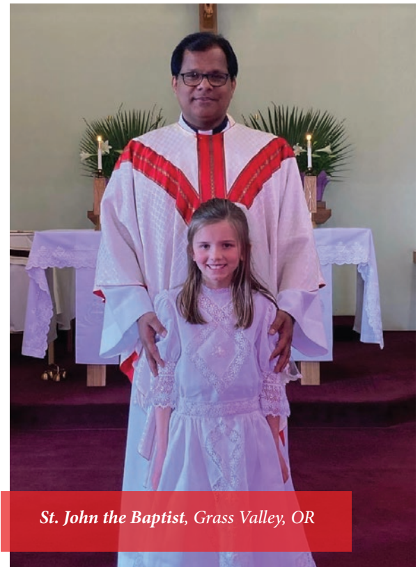
St. John the Baptist, Grass Valley, OR