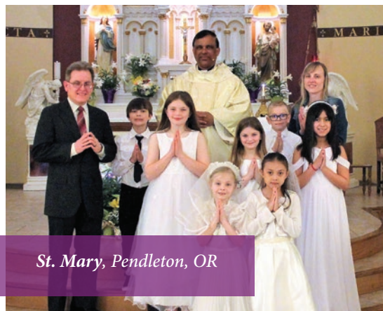
St. Mary, Pendleton, OR