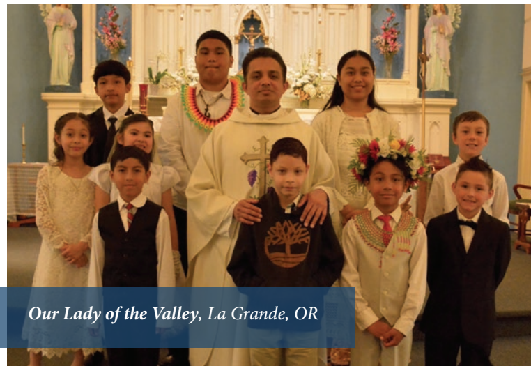
Our Lady of the Valley, La Grande, OR