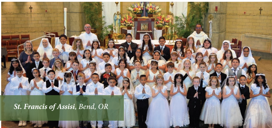
St. Francis of Assisi, Bend, OR