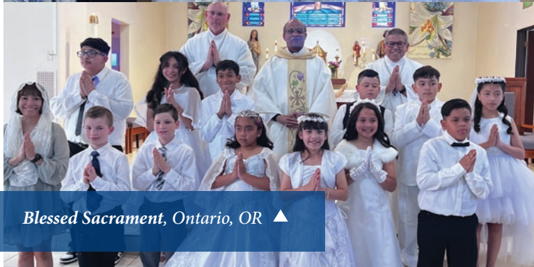
Blessed Sacrament, Ontario, OR ▲