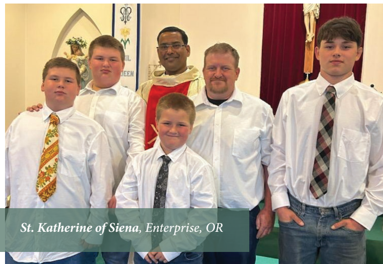
St. Katherine of Siena, Enterprise, OR