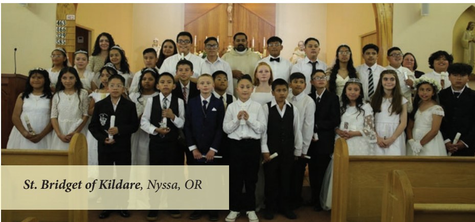
St. Bridget of Kildare, Nyssa, OR