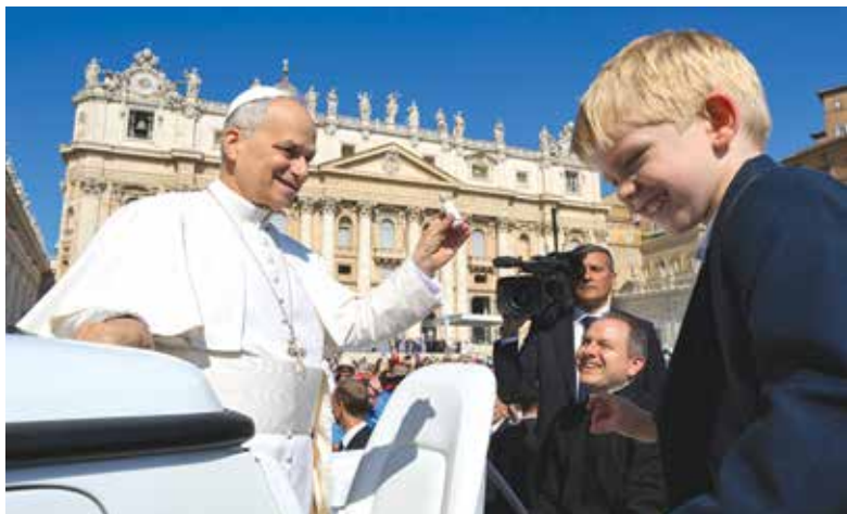
Pope Leo XIV receives a mini figurine of himself from a child as he rides in the popemobile around St. Peter's Square at the Vatican before his weekly general audience Aug. 6.

Vatican City (CNS) —While not neglect “the Lord’s invitation enjoying a summer break from to prepare our hearts by actively school or work, Catholics should participating in the Eucharistic sac-