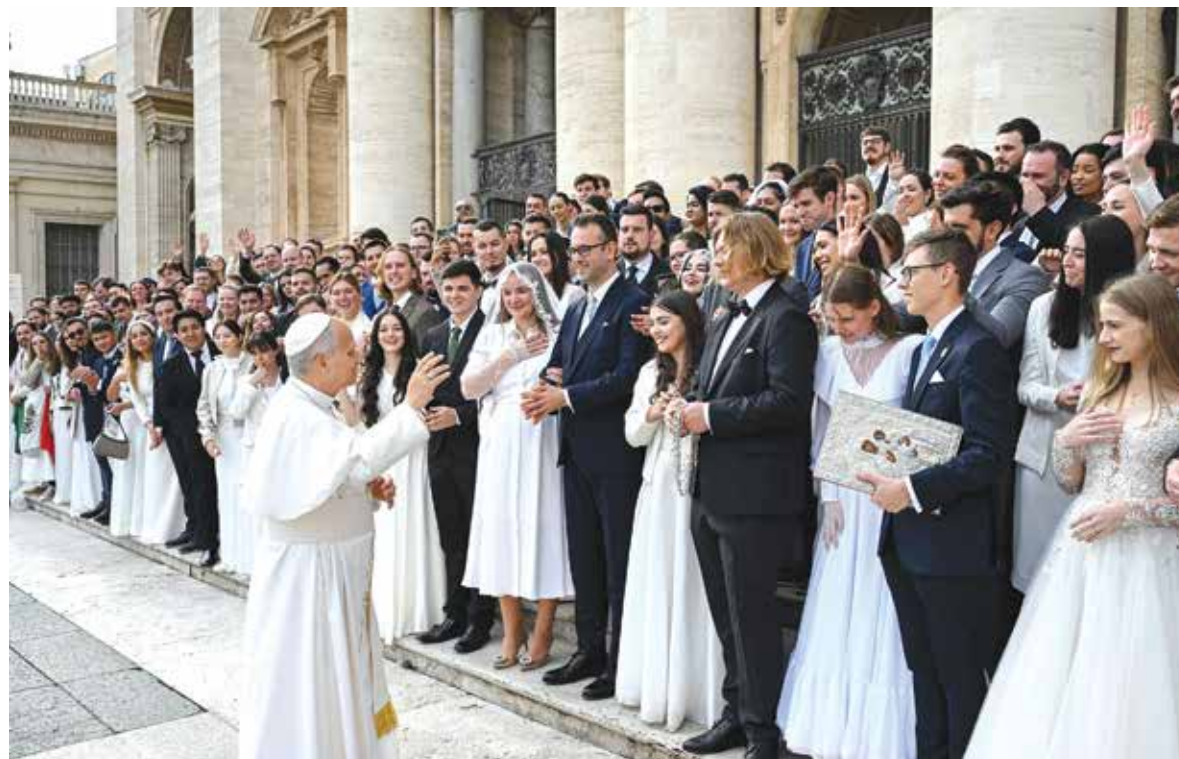
Pope Leo XIV greets newlywed couples who came for a blessing at his weekly general audience in St. Peter's Square at the Vatican Nov. 19.

Vatican City (CNS) —The foundation of sacramental marriage is the unity of the spouses, a bond so intense and grace-filled that it is exclusive and indissoluble, said a document from the Dicastery for the Doctrine of the Faith.