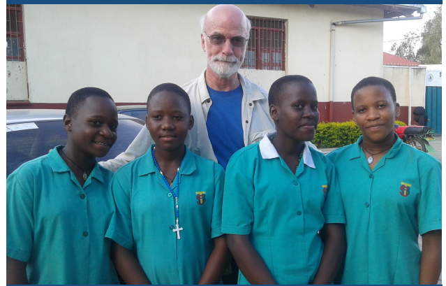
With 4 of the Holy Rosary-sponsored students