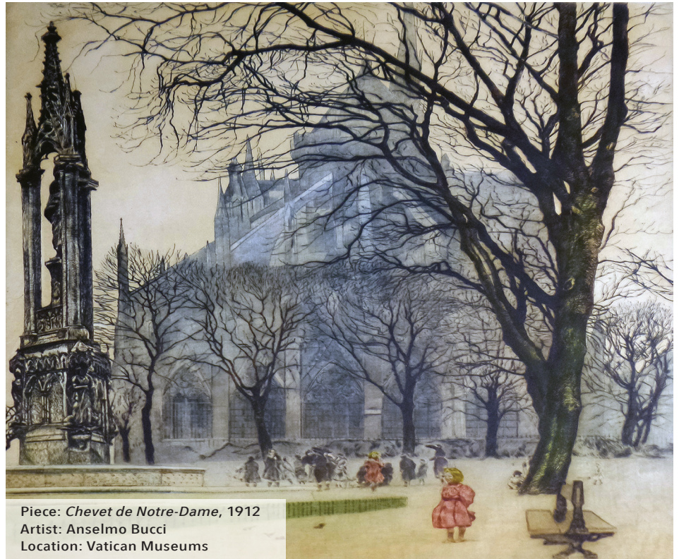
Piece: Chevet de Notre-Dame , 1912

The same can be said of the Church, Christ's kingdom of love. Christ planted the seed of faith in his apostles and that seed spread and thrived all across Europe. Their faith multiplied and grew until all throughout the world the fruits of their faith are on display as a veritable kingdom of charity: hospitals, universities, soup kitchens, AIDS hospices, shelters for the battered and homeless, retreat centers, chapels, churches, museums, research and rehabilitation centers, religious orders, lay associations, volunteer