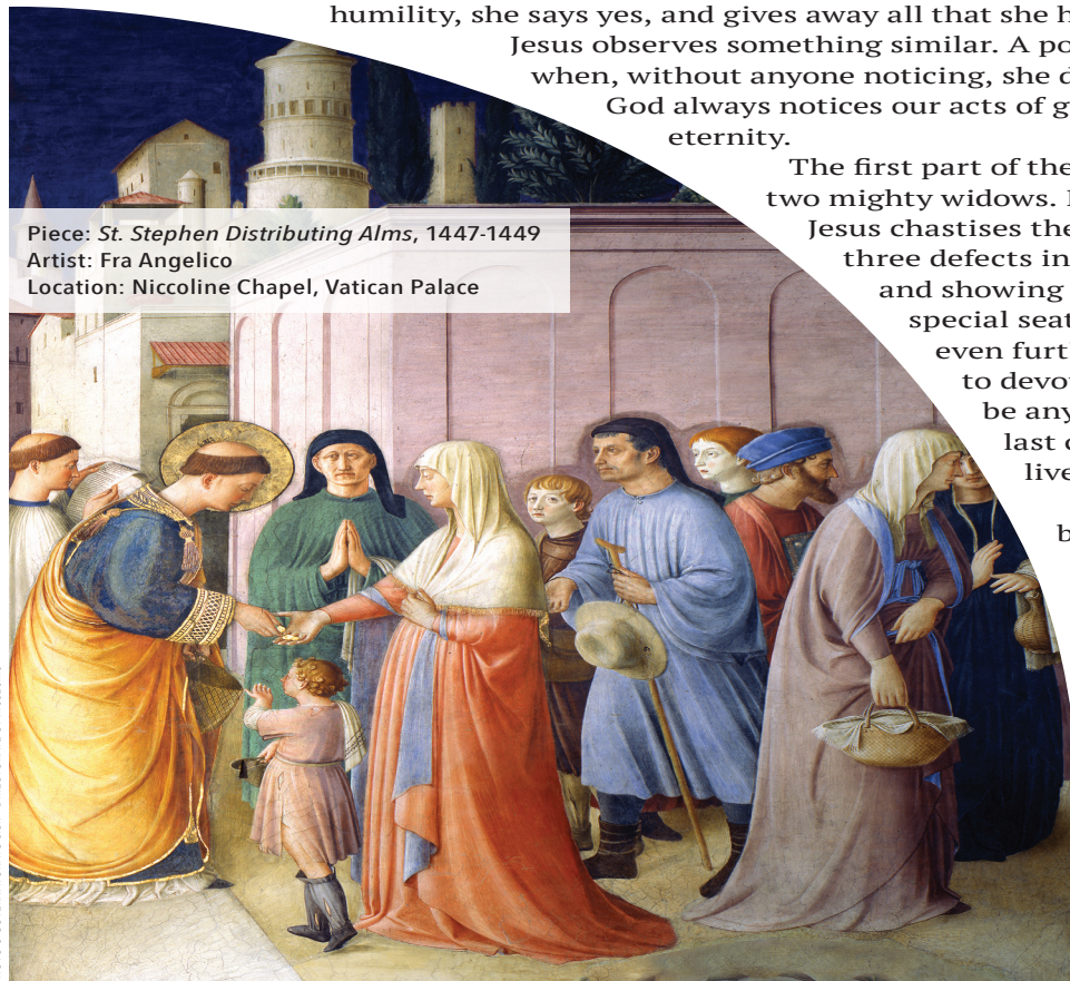
Piece: St. Stephen Distributing Alms , 1447-1449