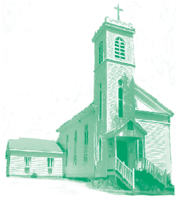
St. Mary's of Galway

Baptisms: Call the Office for confirmation of time (2nd & 3rd Sunday after 12 noon Mass), acceptance of sponsors & instruction for new parents.