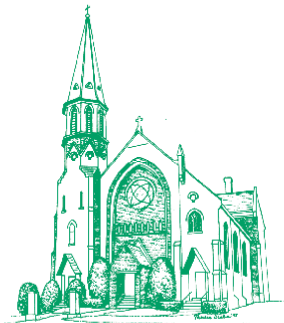
St. Mary's of Ballston Spa