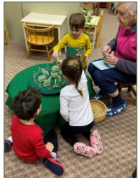
Level I - Good Shepherd Parable