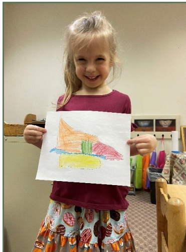
Level I - Land of Israel artwork