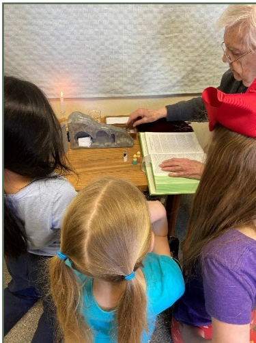
Level II - Empty Tomb

Catechesis of the Good Shepherd (CGS): CGS is a faith formation experience for children ages three to 12 years old. Founded on the principles of Maria Montessori and Sofia Cavalletti, the catechesis is rooted in scripture and liturgy. Central to the catechesis is the atrium, a special environment created to nurture the child's spirituality with beautiful materials that focus the child's attention on key scripture passages or liturgical moments. Children grow in their relationship with the Good Shepherd through Gospel proclamations using the parable method, through prayer, singing, silence, and by exploring liturgical events. Hands-on materials (made by catechists and parish members) are used to help children and adults reflect together upon the great mysteries of the faith. Please see the information above for scheduling of CGS this coming year. Families may register their children for CGS online on our parish website under the Faith Formation tab. Please contact the Faith Formation Office at 412.835.6996, Ext. 226, with any questions.