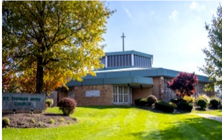
St. Thomas More Church Address: 126 Fort Couch Road Pittsburgh, PA 15241 Parish Office: 412-833-0031 Ave Maria Academy: 412-833-1412