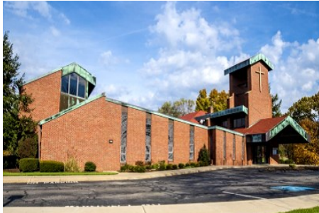
St. John Capistran Church Address: 1610 McMillan Road Pittsburgh, PA 15241 Parish Office: 412-221-6275

July 23, 2023, Sixteenth Sunday in Ordinary Time