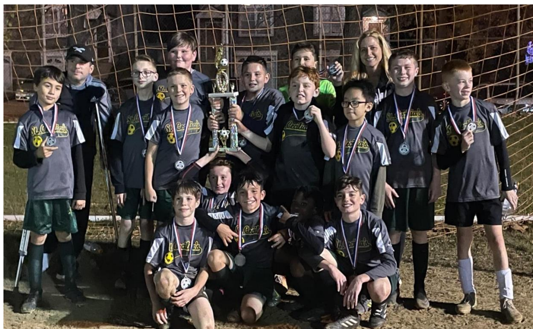
CYO Boys JV Soccer