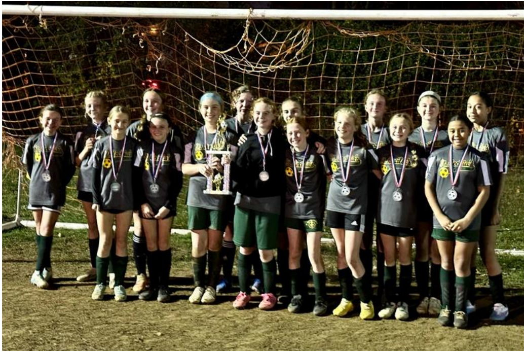
CYO JV Girls Soccer