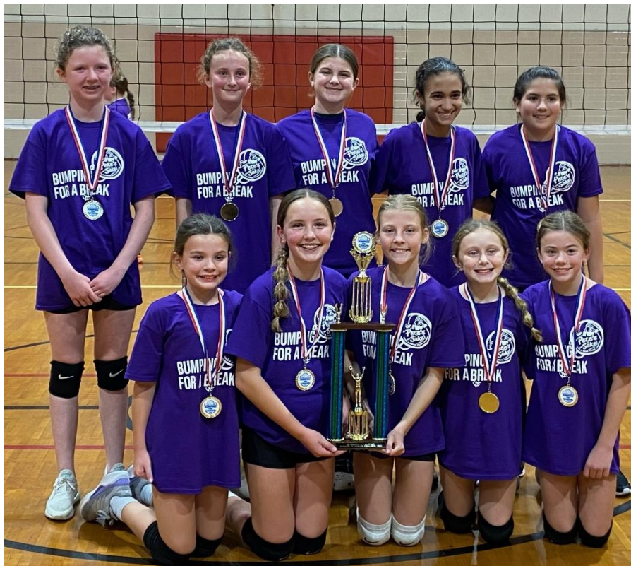
CYO JV Girls Volleyball