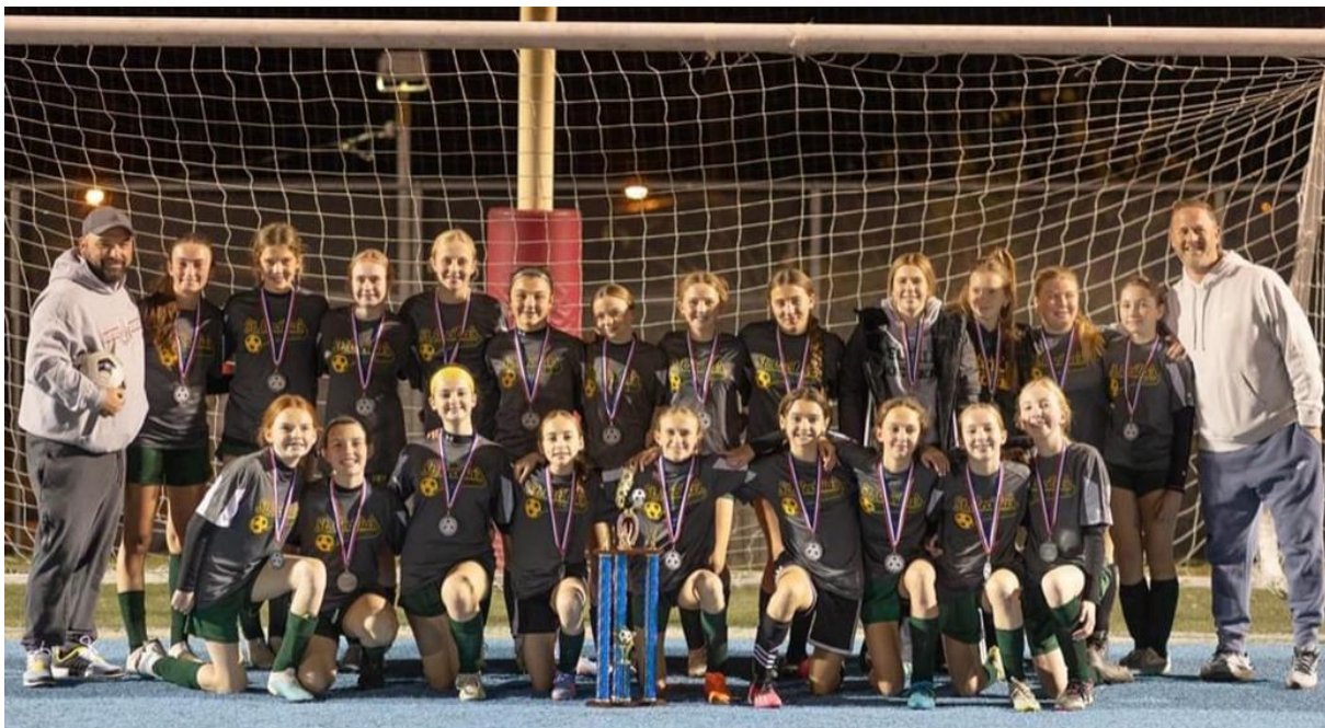
CYO Girls Varsity Soccer

We congratulate our CYO Soccer and Volleyball Teams for great seasons. It was championship week around here. We congratulate our Varsity Girls and JV Boys Soccer Teams for winning their championships this week. We also congratulate our JV Girls Soccer Team who were undefeated until the championship game. They lost in a shootout! Finally, we congratulate our CYO JV Girls on their volleyball championship on Saturday! We thank all our players, their parents, and especially their coaches for all their hard work! God bless you!