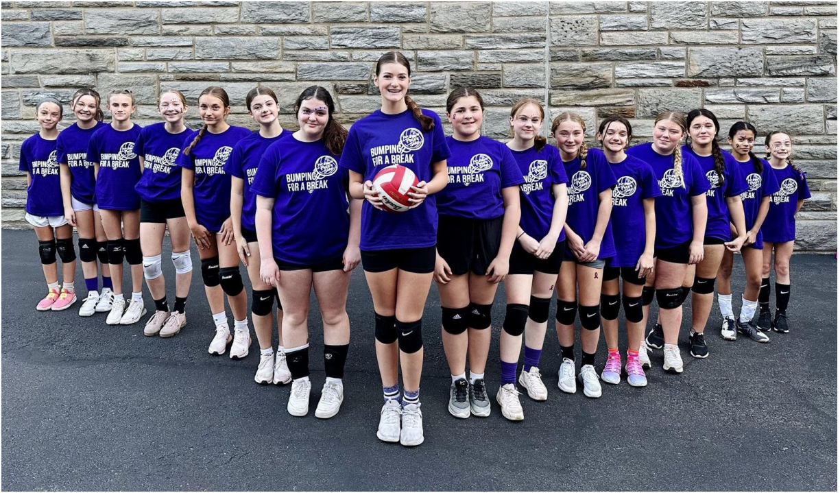
CYO Varsity Girls Volleyball