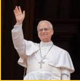
From the Homily at the Inaugural Mass Pope Leo XIV

In the words of St. Augustine: "The Church consists of all those who are in harmony with their brothers and sisters and who love their neighbor" (Serm. 359,9).