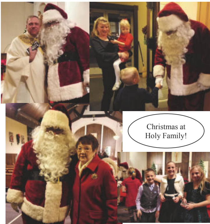
Christmas at Holy Family!

Please consider using your time and talent by becoming a minister.