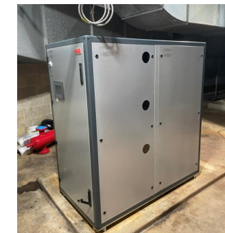
The new boiler installed in August 2023

As many of you know, the church boiler was installed when the church was built in the 1960's. The past few years there has been an increase in the number of repairs needed to keep it operational. This past winter there were two instances of the boiler not functioning for multiple days during very cold weather. In addition, the temperature control system in the church has not been working correctly which at times has caused it to be uncomfortably warm in winter and cold in summer. This overuse of the systems has driven up our electric and gas bills.