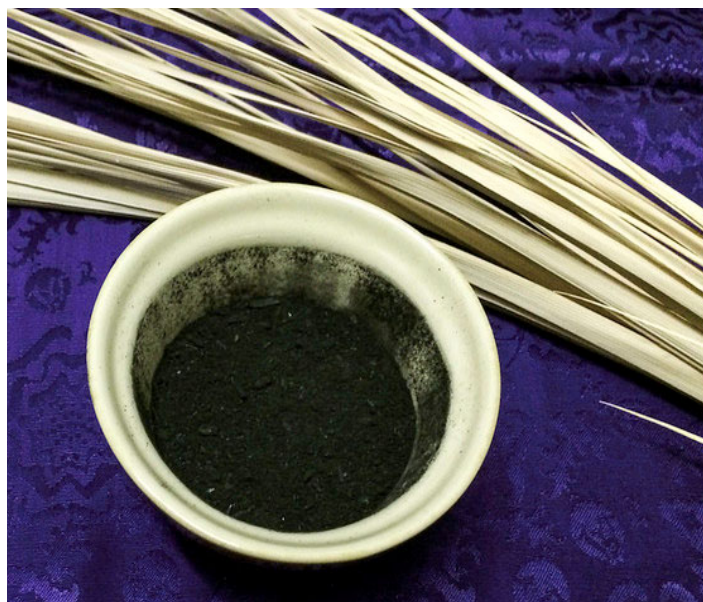
"Ash Wednesday" by Lawrence OP is licensed under CC BY-NC-ND 2.0