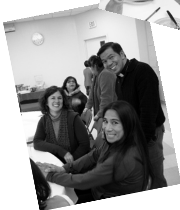
Photos from our recent catechist gathering during the Presentation of the Lord.

During this Lenten Season, please continue to keep the following Elect in your prayers as they prepare to receive the Sacraments of Initiation at the Easter Vigil Mass: