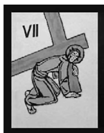
Jesus falls a second time.