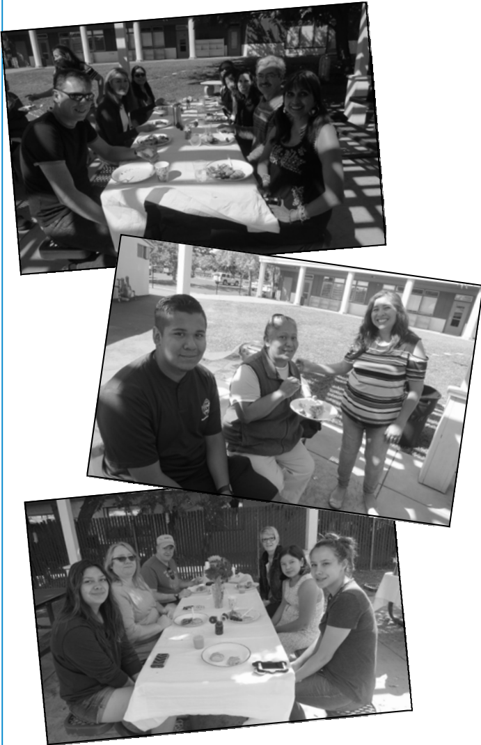
Our catechists at the Catechist Appreciation Brunch earlier this month.

Family Faith Formation at St. Catherine's Church