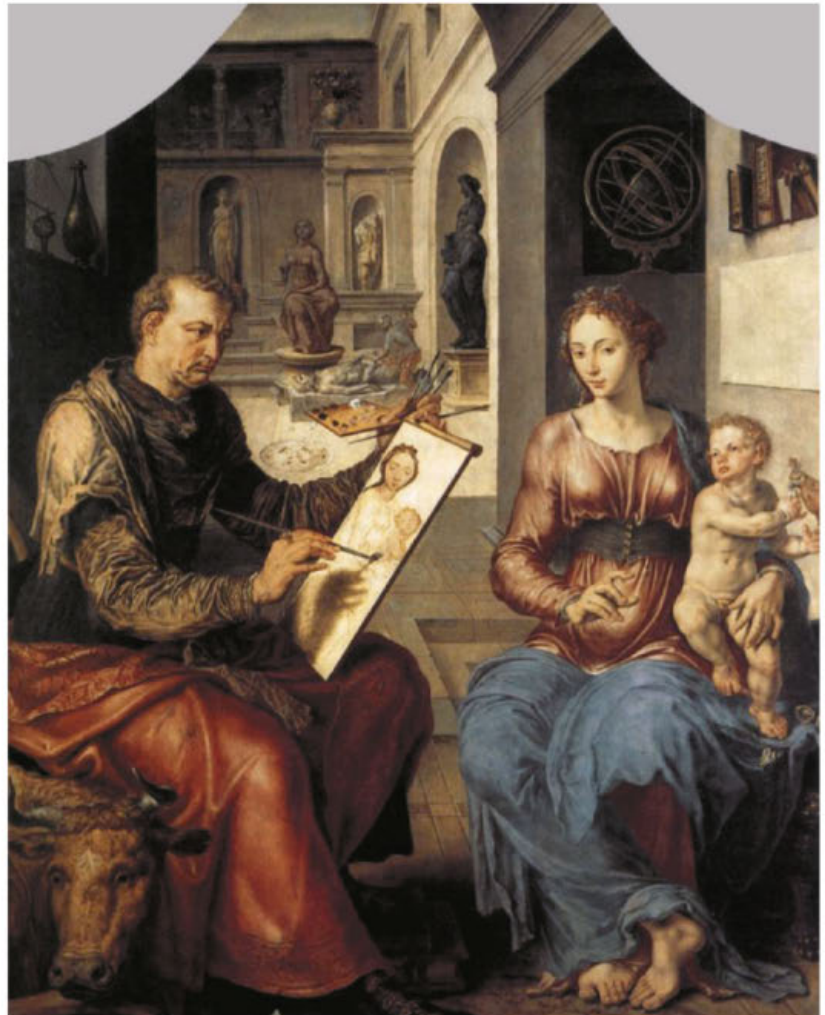
ART BY MAARTEN VAN HEEMSKERCK - "ST. LUKE PAINTING THE VIRGIN"