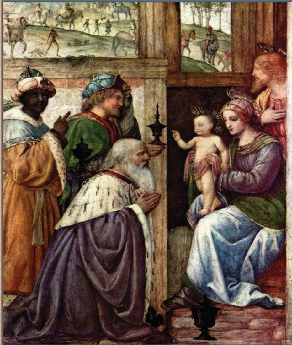
THE EPIPHANY of the Lord