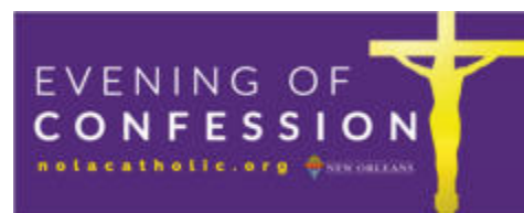
Most Reverend Gregory M. Aymond Archbishop of New Orleans