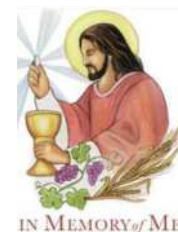
IN MEMORY of ME

Visit aolparish.org to make your Mass Intention Request online.