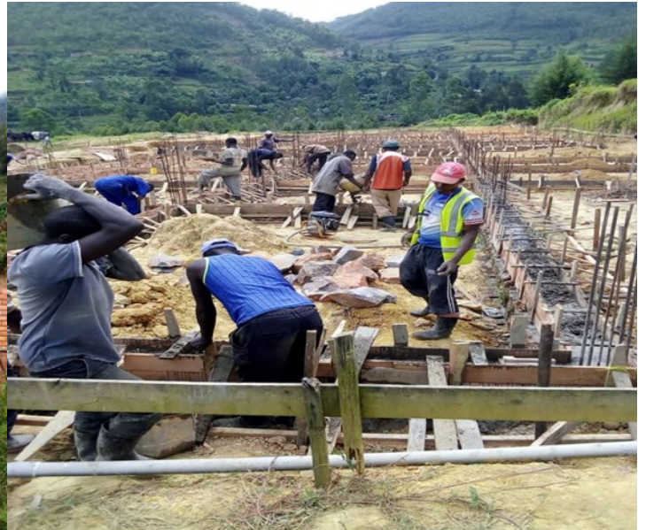
CONSTRUCTION WORKS FOR THE GIRLS' APARTMENT AT THE COLLEGE DON BOSCO DE RUSHAKI AND COMPLETE FOUNDATION AND HOW IT WILL LOOK LIKE AT ITS COMPLETION