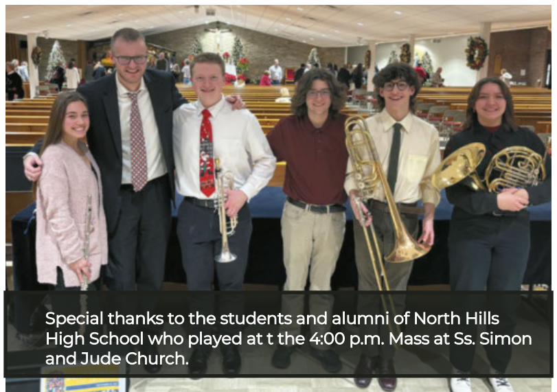
Special thanks to the students and alumni of North Hills High School who played at the 4:00 p.m. Mass at Ss. Simon and Jude Church.