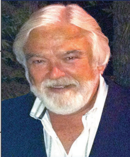
Parishioner & Usher

Call (408) 354-1312 15899 Los Gatos–Almaden Rd. Suite 8 Los Gatos, CA 95032